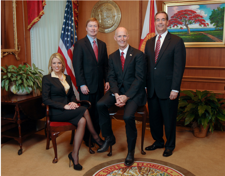
Rick Scott Governor