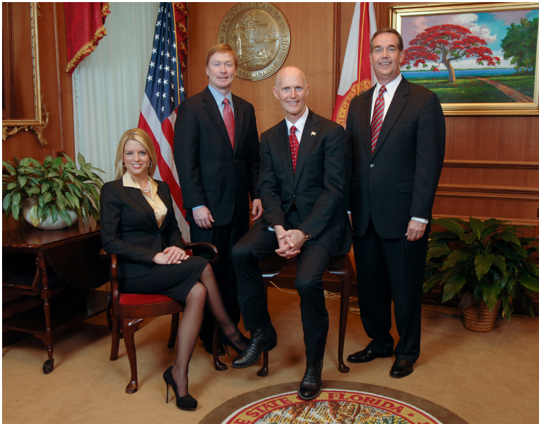
Rick Scott Governor