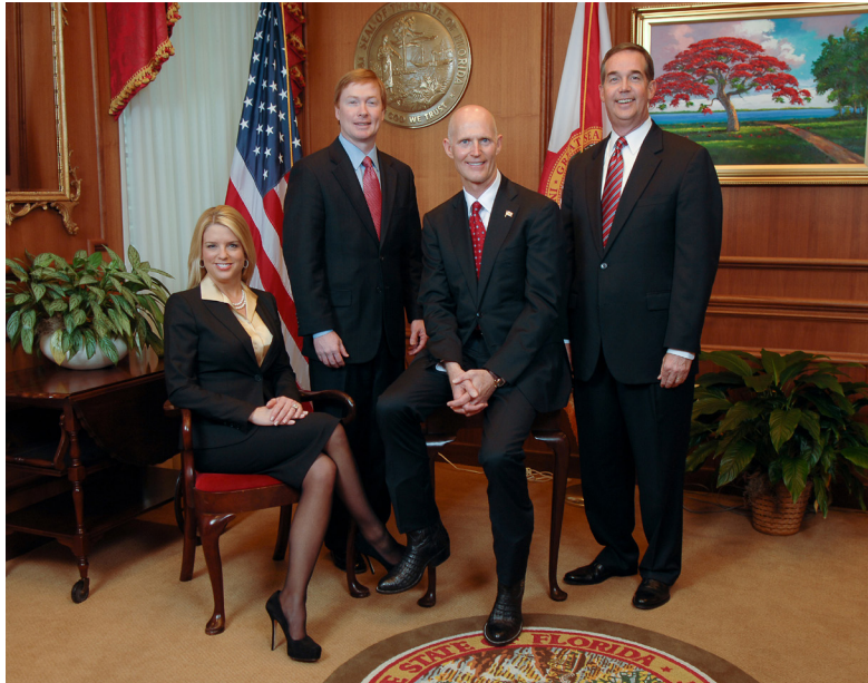
Rick Scott, Governor